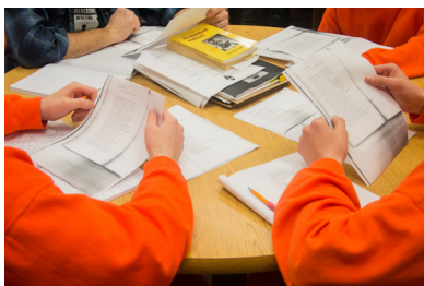
A workshop at Skagit County Juvenile Detention, reading Etheridge Knight.

If you have questions, please e-mail matt@undergroundwriting.org and visit us online at undergroundwriting.org . ♦