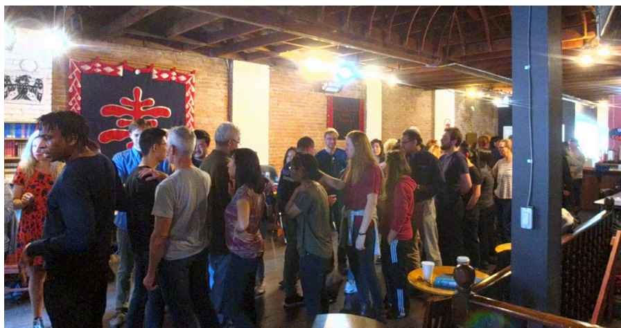
A prayer tunnel for reconciliation, liberation, and forgiveness at Street Church in Vancouver, BC. The People’s Seminary hosted Transformational Ministry for People on the Margins this past October.

So we prayed together. And as he let himself name the violence he received, he wept and was able to forgive his dad. The oppression of unforgiveness that fueled his anger was lifted. Jesus set him free and transformed his relationships. ♦