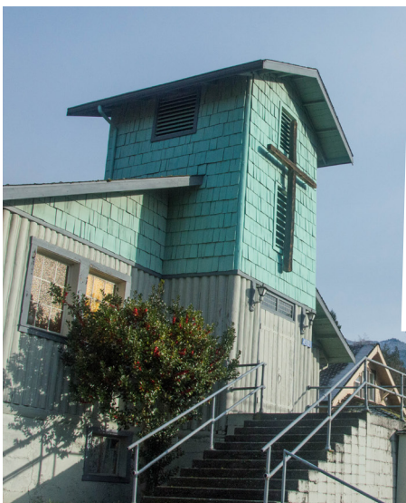
Mount Baker Presbyterian Church in Concrete, Washington.

For the first time in our lives, we take the hard road in everything we do by choice. That's what we want to do. We want to follow God. ♦